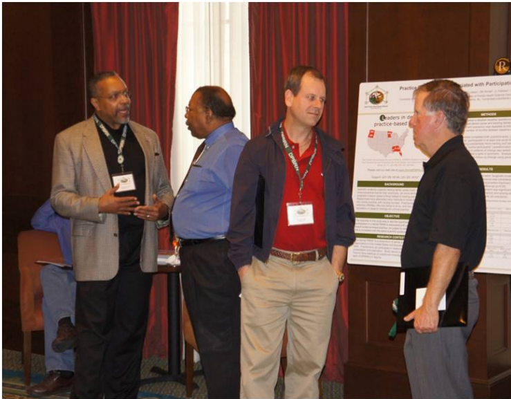
Practitioner-investigators discuss the meeting during the break.