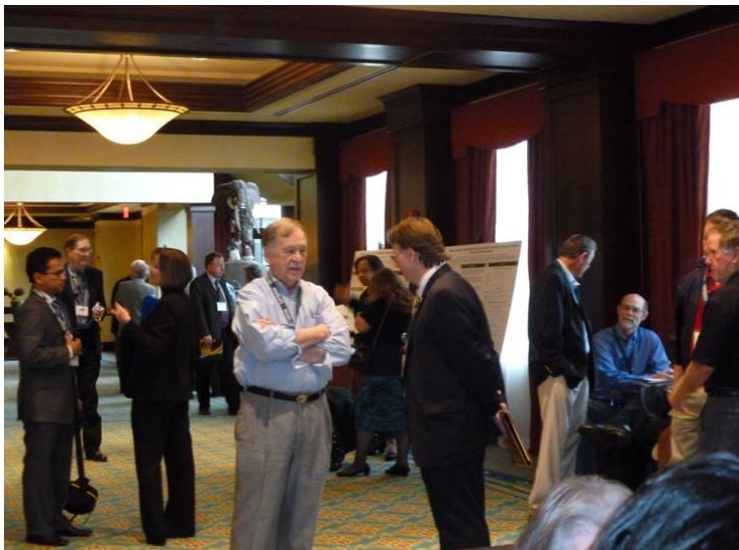
Practitioner-investigators socialize before the meeting begins.