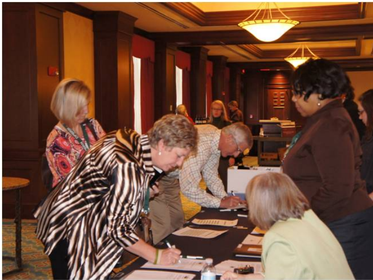
Practitioner-investigators checking in for the meeting.